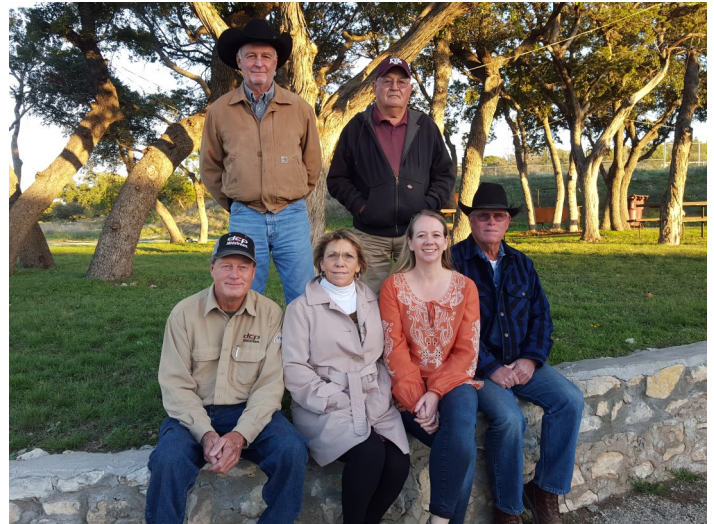
Ozona Country Club Board of Directors:

The Chamber of Commerce would like to recognize the Ozona Country Club and thank the organization for their partnership and assistance with the success of the Chamber Bi-Annual Oil and Gas Trade Show.