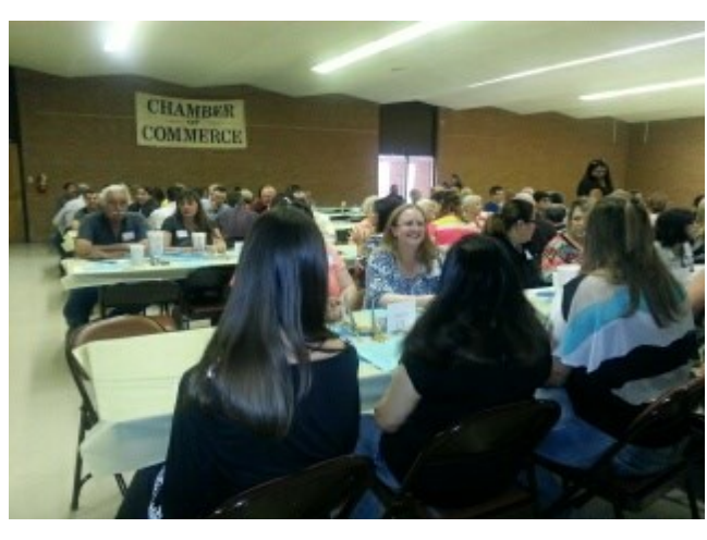
Guests enjoy socializing at the banquet!